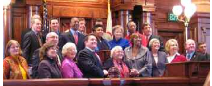
The Illinois Presidential Electors