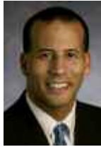
Meet special guest Dan Seals

Location: Renaissance Chicago North Shore Hotel 933 Skokie Boulevard Northbrook, IL 60062