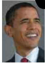
Watch Obama's historic speech