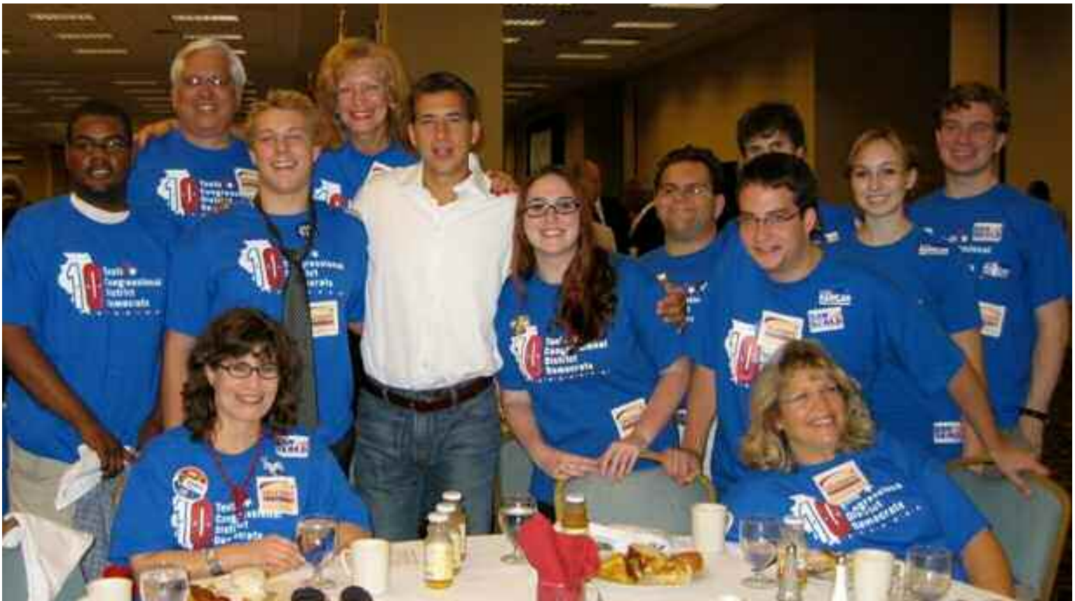
Tenth Dems activists and interns share a moment with State Treasurer Alexi Gianoulias at the Illinois State Democratic Convention.