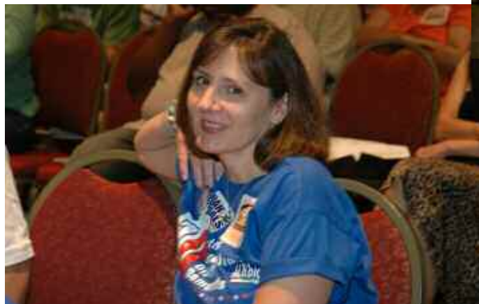
Tenth Dems conventioneers heard from Illinois Senator Dick Durbin, New Mexico Governor Bill Richardson, Illinois Attorney General Lisa Madigan, and other luminaries.