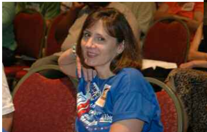
Tenth Dems conventioneers heard from Illinois Senator Dick Durbin, New Mexico Governor Bill Richardson, Illinois Attorney General Lisa Madigan, and other luminaries.