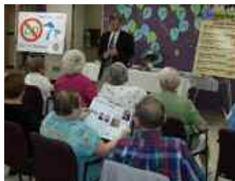
Kirk distorts his record on the environment before an audience of about 50 senior citizens at a forum in Wheeling on July 28th.

Regular readers of this newsletter have seen many examples of Mark Kirk's misleading public statements in the past. Kirk uses press releases and printed campaign literature sent to constituents to improve his image, and he often relies on misleading information to do so. Perhaps our congressman feels compelled to mislead the voters in his district, given the mediocre voting record he has compiled over the last seven years on issues important to his constituents. The environment is a case in point.