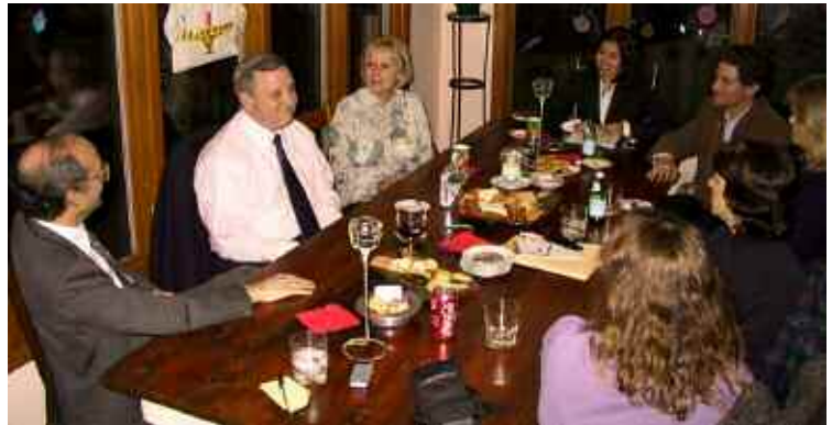
Dick Durbin meets with Citizens for Lake Safety to discuss live fire threat

Over the past 10 weeks or so, Citizens for Lake Safety ( www.citizensforlakesafety.org ) may not have changed the world, but we certainly had a decisive impact in our little corner of it. Beginning as a small group of concerned citizens who were outraged upon learning that the United States Coast Guard had begun to conduct live