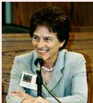
Impeachment advocate and former Congresswoman Elizabeth Holtzman

However, a case for impeachment is not made by a litany of illegal acts, because the constitutional standard is not the violation of law, but "high crimes and misdemeanors." Impeachment advocate, author, and former Congresswoman and member of the House Judiciary Committee in 1974 during the Watergate crisis, Elizabeth Holtzman, believes that the high crimes and misdemeanors standard has been met in the case of Bush and Cheney because