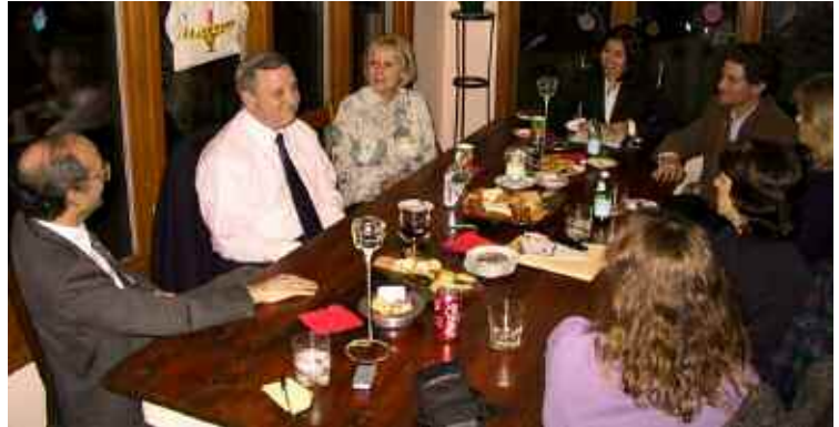
Dick Durbin meets with Citizens for Lake Safety to discuss live fire threat

Over the past 10 weeks or so, Citizens for Lake Safety ( www.citizensforlakesafety.org ) may not have changed the world, but we certainly had a decisive impact in our little corner of it. Beginning as a small group of concerned citizens who were outraged upon learning that the United States Coast Guard had begun to conduct live