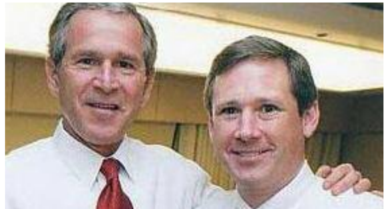
No caption necessary.

What's involved in "twisting arms" to make sure the vote count is what they want? Are congressmen promised more pork for their districts? Are they threatened with punishment such as blocking their bills from getting to the floor for discussion and consideration, or loss of advancement opportunities in the Republican hierarchy?