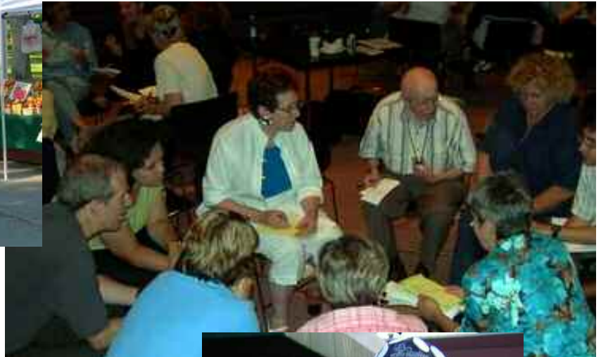
Small group discussion were a part of a Tenth Dems seminar in Northbrook on "framing" issues in a political campaign.