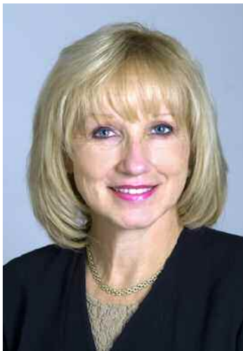
State Representative Karen May (D-Highland Park)

Coal-fired plants are the largest source of mercury pollution in Illinois, emitting an estimated 6,000 pounds of mercury into the environment each year, and are the single biggest cause of the Mercury Advisories issues by the Illinois Department of Public Health for 14 bodies of water this year. Illinois has 23 quarter-century-old coal-fired power plants that avoid tighter mercury controls due to their age. Current proposals for new plants do not use the cleanest technology available. The Illinois EPA requires proposals for new plants to evaluate cleaner technologies, but does not require their use.