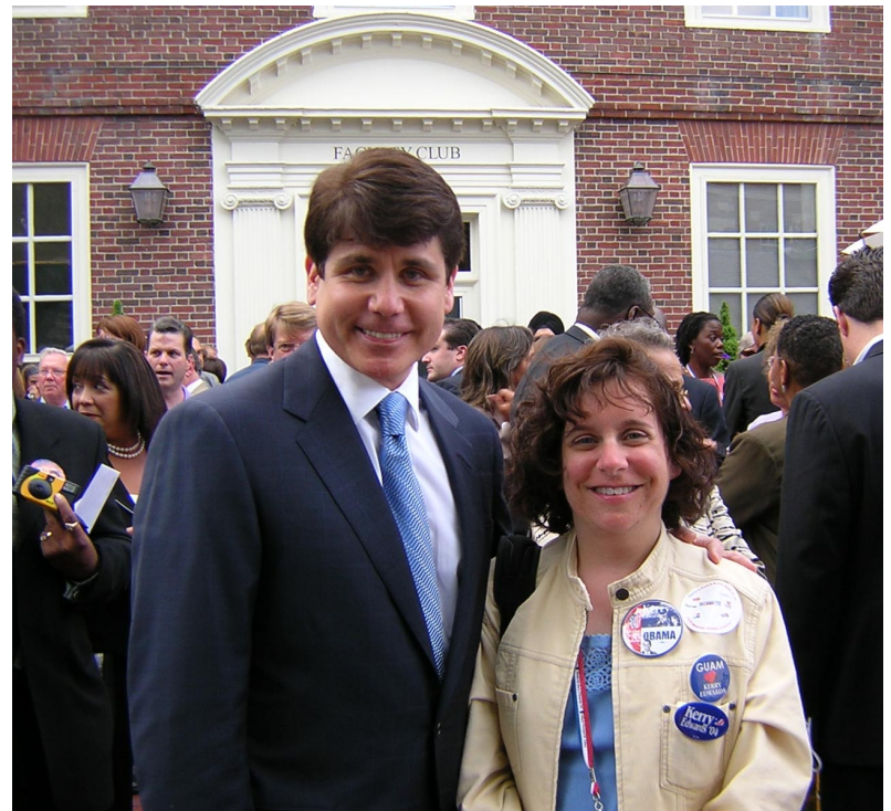
Gov. Rod Blagojevich and Ellen Beth Gill at a gathering of Illinois delegates at the Democratic National Convention in Boston.