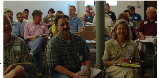
Precinct Committeemen and other activists gather in Waukegan for a training session offered by the Illinois Tenth Congressional District Dems.

The Tenth Dems plan two more training sessions this summer. One will be August 7, at the Highland Park Public Library at 494 Laurel Avenue. The other is at 6:30 p.m., August 25, at the Vernon Area Public Library at 300 Olde Half Day Road in Lincolnshire.